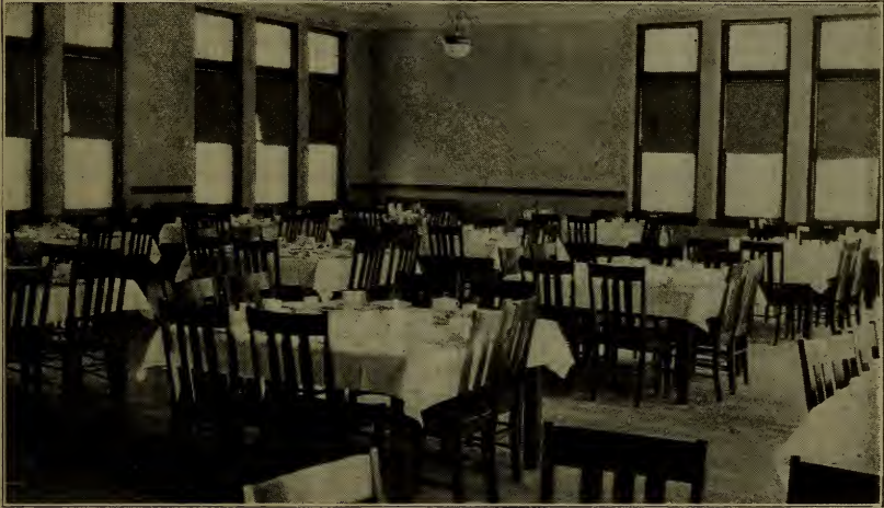
Interior of Loyalty Hall.

Last, but not least, of the organizations which make life pleasant at the College is the Boarding Club. Officers of the Club are elected by the members from among their own number. Election is held each spring. Those elected have complete charge of all matters pertaining to the board during their term of office. A report is made to the members of the club each month. Board is furnished at absolute cost. Loyalty Hall, which was erected in 1916 as a dining hall, is the property of the Boarding Club and furnishes excellent quarters for this important organization.